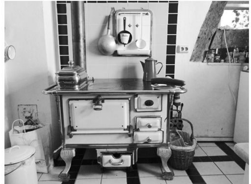
ÄLTERE MENSCHEN GEBEN IHREN ERFAHRUNGSSCHATZ AN KINDER WEITER